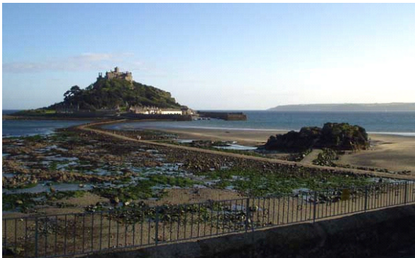
Causeway leading to St Michael's Mount