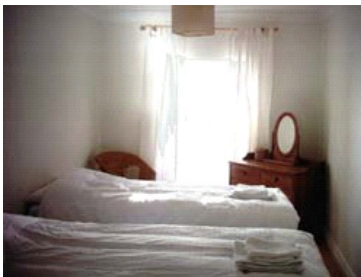
Twin divan Bedroom

TARIFF: We are open all year, our prices ranging from £ 330 in the low season to £ 680 in the high season.