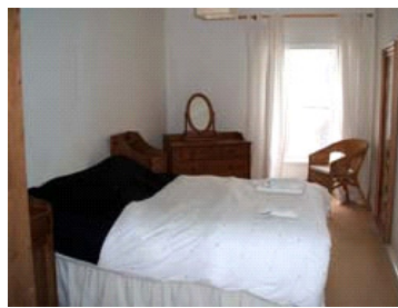
Double Divan Bedroom