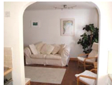
Lounge From Kitchen