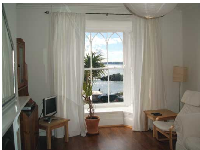
Lounge window overlooking St Michaels Mount & Mounts Bay