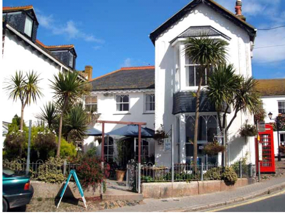
Flats Located Above Seagrove Gallery

Marazion is served by a good bus service. There is a traffic free cycle path across the top of the beach, which one can follow to Penzance.