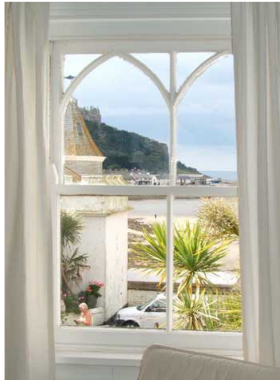
View from window overlooking St Michaels Mount

Cleanliness is assured, every effort being made to ensure a pleasant and relaxing stay.