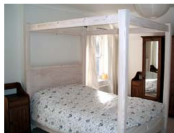
Four Poster Kingsize Bed