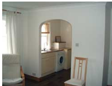
Kitchen from Lounge